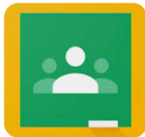
Google Classroom - Ap...