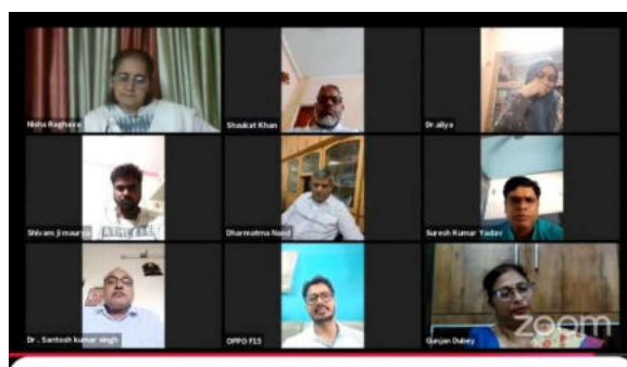
Copy of Mathura PG College Rasra Ballia..